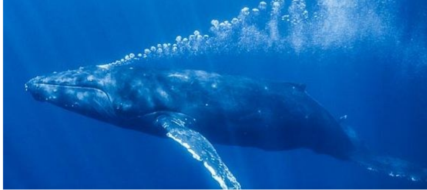
Fig. 2. Bubble-net feeding behavior of humpback whales [16].

feeding technique. This scavenging behavior concerns initiating a special spiral-shaped (9 shape) path.